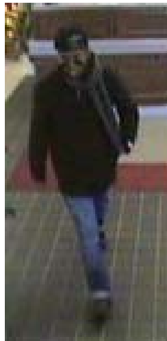
Bank Robbery Suspect, Close-up and Full-length

Anyone with information is asked to contact Crime Solvers by phone at 1-866-411-TIPS/8477, e-mail at www.fairfaxcrimesolvers.org or text "TIP187" plus your message to CRIMES/274637 or call Fairfax County Police at 703-691-2131.