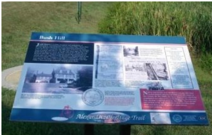
Bush Hill Marker

An historical Bush Hill marker was erected in 2007 as part of the 23-mile Alexandria Heritage Trail by "KSI in cooperation with the Alexandria Archeological Museum ." For a complete review of the inscriptions and photographs as well as a map to the marker, go to http://www.hmdb.org/marker.asp?marker=2610 .